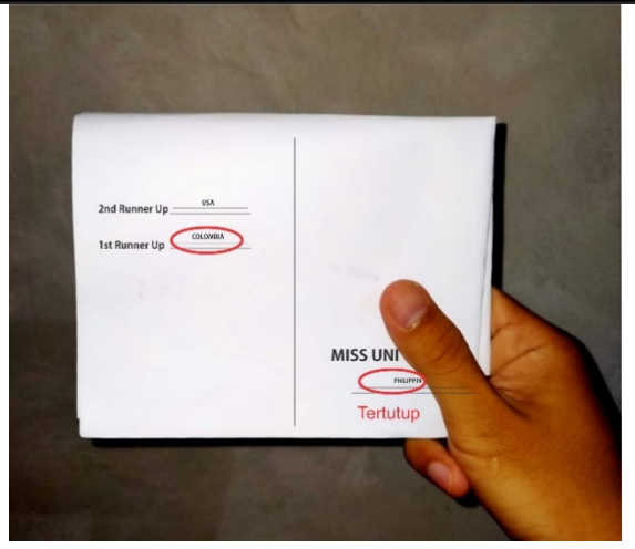
Figure 6. The Illustration of Steve Harvey's Hand Position

The arrangement model of the layout that was not taken into account and prepared carefully had made the writing of the 2015 Miss Universe winner label on the bottom right covered by the thumb of the host. Consequently, of course, it reduced the eye's focus in that direction or space. Therefore, in the announcement card, the winner's name should be placed in a space that has clear legibility for the reader's eyes.