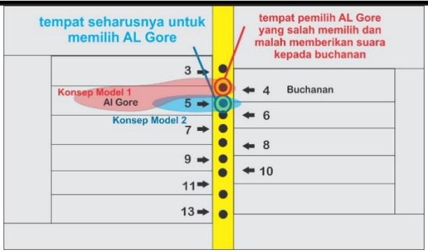
Figure 2 . The 2000 United States Presidential Election Ballot Design (simplified)