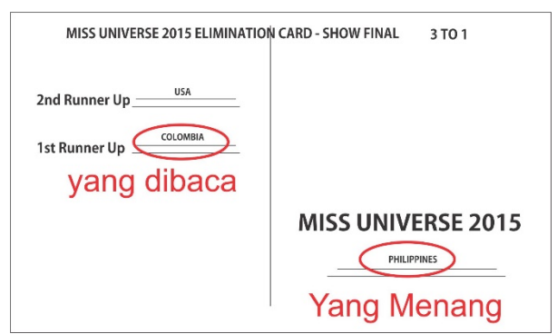
Figure 4. The 2015 Miss Universe Winner Announcement Card (simplified)

up, second runner up terms also should further falsely convince the reader that the name on the top left is the winner. The use of the language should be replaced with the first, second, and third winners and should be written in sequence so as not to cause errors in understanding the information contained in the design.