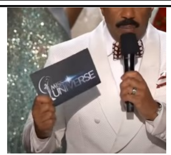
Figure 5 . Steve Harvey's Hand Position